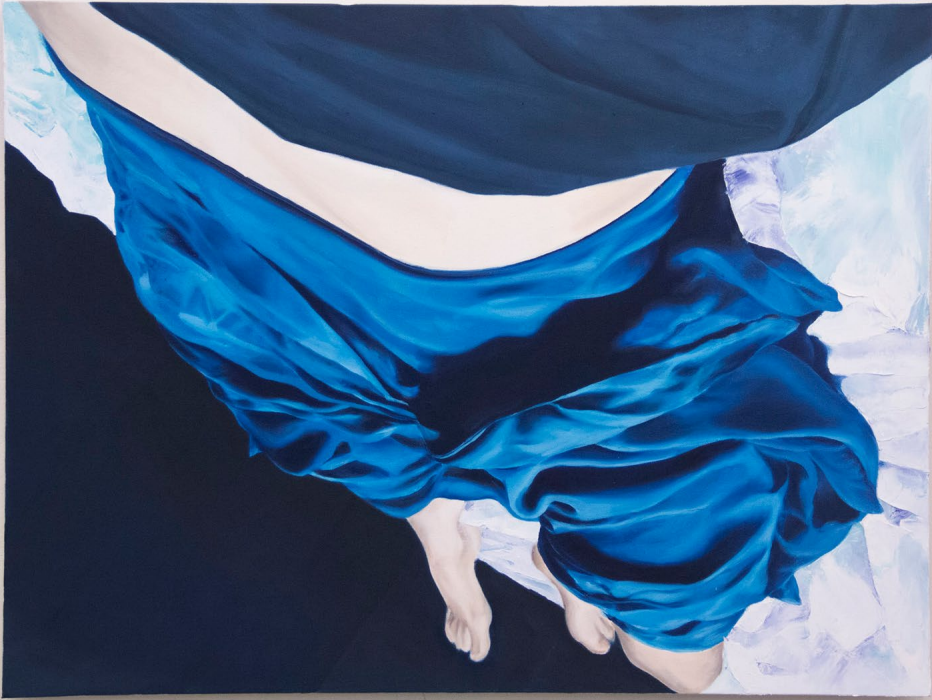
Void Oil on Canvas