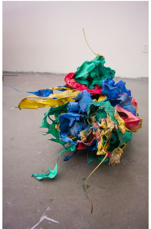
Limb #3 Melted Oversized Lego Bricks