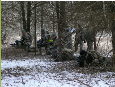
CDTs consolidate on the objective.

Armed with M16 rifles, an AT4 Anti-Tank Missile Launcher, land navigation equipment, backpacks of equipment and layers of cold weather gear, we navigate through the woods along our planned routes using the lessons learned from the previous day's land navigation training and link up with the rest of our Platoon and Company as the day wears on. The day is full of changing missions and a variety of enemy and civilian interactions. All of which are designed to create learning experiences for operating as a future Army Officer.