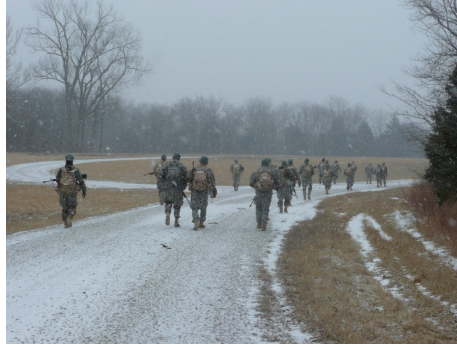
The US platoon returning to the warm barracks.

Many leave this weekend having learned a lot about the Planning and Orders Process of the Army, but most leave having learned much more about themselves. Most have even gained confidence in their abilities to lead, plan, and execute - many things they have never encountered before. Here at Gateway ROTC, leadership is not only learned in theory, but through critical application on life experiences. No other class gives students the ability to plan and execute their own learning objectives and this is what I believe keeps us all coming back for more.