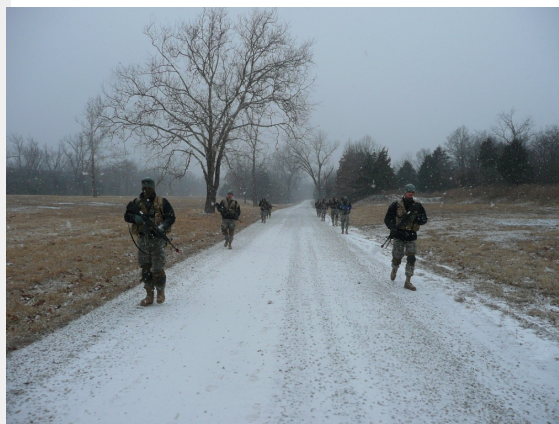
The OPFOR platoon returning from training.

I learned a lot this weekend about the possibilities of being the OPFOR for an LTX. My squad's missions as OPFOR consisted of real Operations Orders (OPORDs) and Troop Leading Procedures (TLPs), things that are routine for the side that is being trained (the US forces). As OPFOR this weekend, I felt like I was being trained, not just playing a part. On the contrary, my squad learned a lot about operating in inclement conditions, land navigation, and real combat effectiveness as a unit.