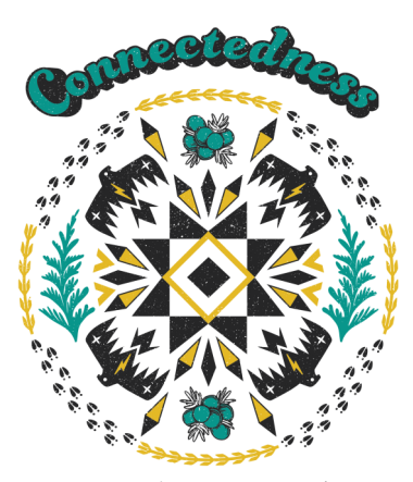
Connectedness is Medicine Washington University 32" Annual Powwow

This year's logo represents how connectedness to all things is medicine. Nature is the anchor of which all life and spirit is built. The deer tracks and corn stalks represent the food we eat to nourish our bodies. The cedar and juniper berries are the medicine that heals us. The Thunderbird brings rain storms making it possible for all things to flourish. The star quilt pattern in the center represents the connectedness of all tribes of turtle island. Even though each piece is different, they work together to create a beautiful design that connects us all together.